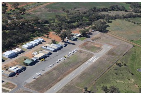
Northam Airfield – a view from the air on 6th August 2023