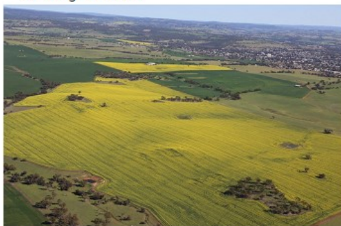
From the air – our stunning Wheatbelt